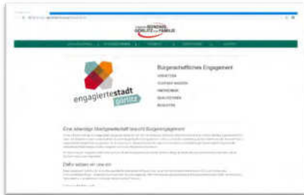
Online presence (websites) for initiatives