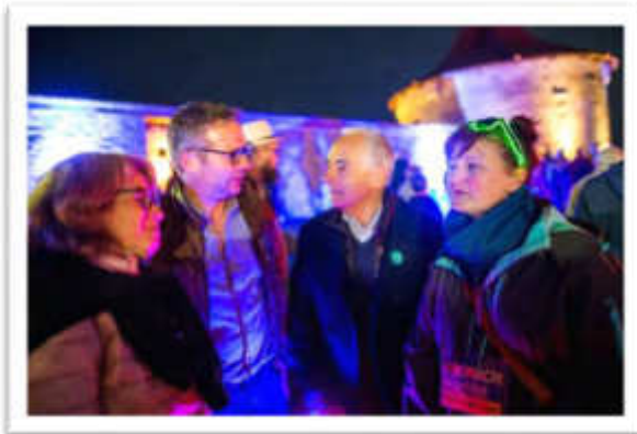
Local cooperation networks