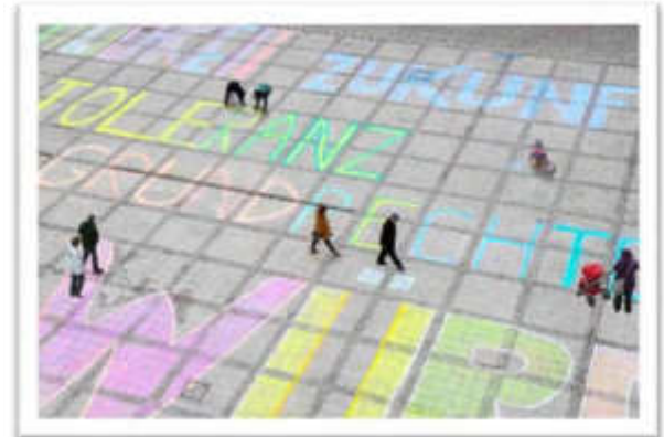
Joint actions against right wing-movements