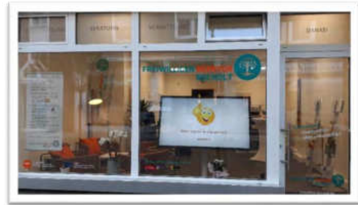
Points of contact